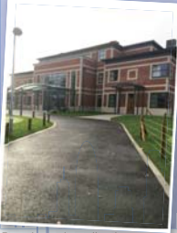
Brand-new boarding house

I am a boarder which means I am living in school (boarding house) 24 hours by 7. There are 3 boarding houses in my school: Oxford, Cambridge for boys while Queens's is only for girls. I am lucky enough to stay at Oxford, which is a newly built building, and that made me even more excited and happier than I expected. I am sharing a room with 1 roommate, he is a Spanish student and he is also at the same year as me. While studying here in the UK, I have more opportunities to do sports. In my school, students are required to do 3 lessons of Games and 2 lessons of PE (40 minutes each) every week. The school curriculum here is a bit different from the one in Hong Kong. We have subjects that are not available in Hong Kong, like German/Spanish/French, Theology & Philosophy, Food Technology, Drama, Media Studies and Computer Science. I really enjoy studying abroad. It is not as scary as I first thought, but first you should make more new friends. Don't feel afraid of speaking English otherwise you will never get any improvement. Spend more time at the English corner and expose yourself to English as much as you can!