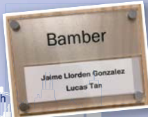
My room name and me and my roommate's name