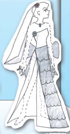
Wing Tsang 2E(29)