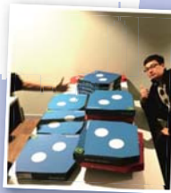
Having free Domino's by School