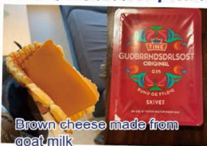
Brown cheese made from goat milk