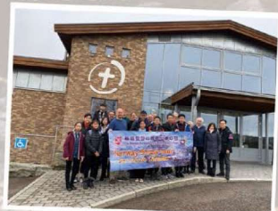
Here comes the Oslo Misjonsskirke Bethlehem (Oslo Covenant Church Bethlehem)