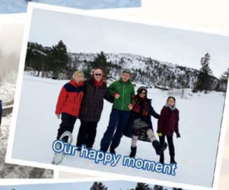
Our happy moment