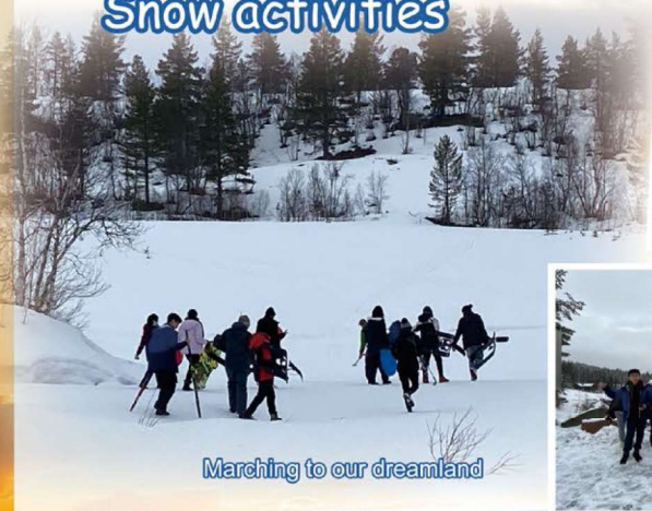
Marching to our dreamland