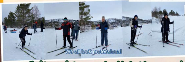
We all look professional