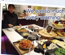
We eat so much every morning