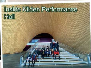
Inside Kilden Performance Hall