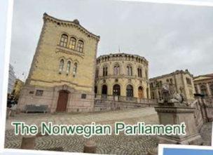
The Norwegian Parliament