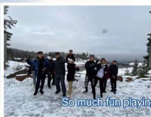
So much fun playing with snowballs