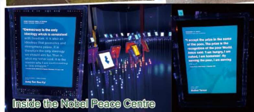
Inside the Nobel Peace Centre