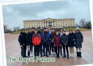
The Royal Palace