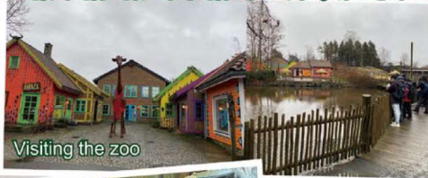
Visiting the zoo