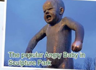
The popular Angry Baby in Sculpture Park