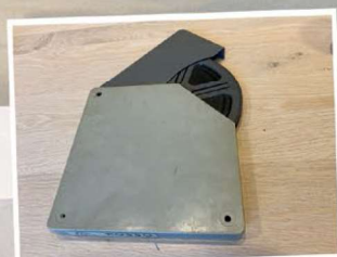
Another treasure – recorded by the Holm-Glad Family in 1966 when they were in Hong Kong