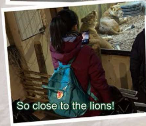
So close to the lions!