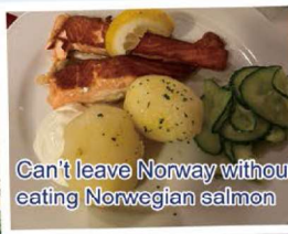
Can't leave Norway without eating Norwegian salmon