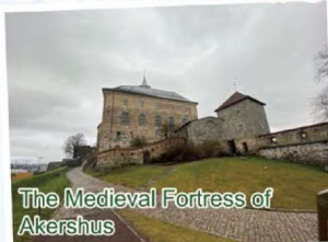
The Medieval Fortress of Akershus