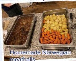
Homemade Norwegian meatballs