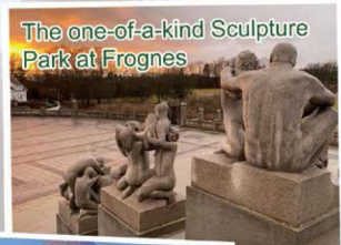
The one-of-a-kind Sculpture Park at Frognes