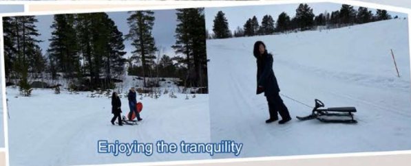
Enjoying the tranquility