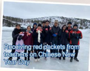
Receiving red packets from teachers on Chinese New Year Day